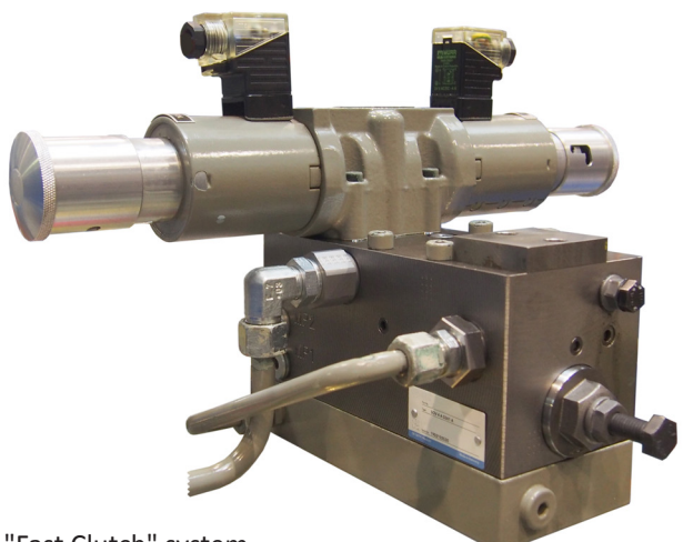
"Fast Clutch" system (shown here with electric control valve)